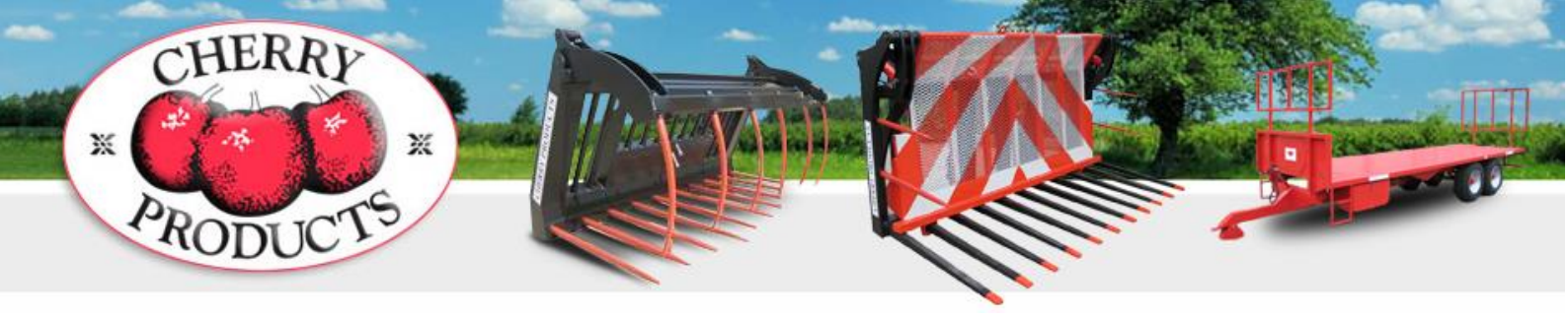
Operating & Maintenance Instructions – Over Arm Bale Grab